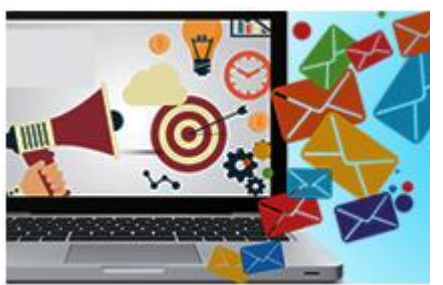
Sms / Email campaigns